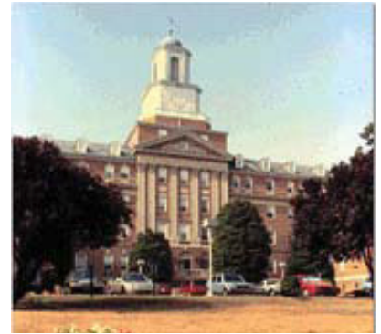
Coatesville VA Medical Center