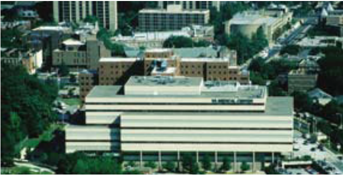
Philadelphia VA Medical Center

VA planners expect about 400 troops at each medical center, where they will work with health care providers to identify potential health issues – and treat known health problems before they affect a person’s future deployment status or career. According to DOD officials, many deployment-related health problems may not arise until three to six months after someone returns from deployment.