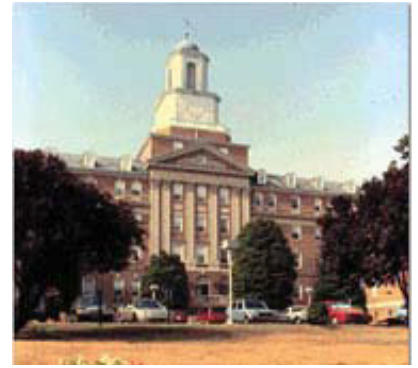
Coatesville VA Medical Center